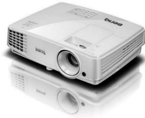
Liquid Crystal Display (LCD) projector